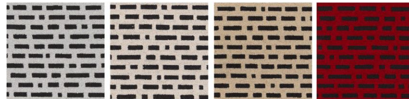
JOLIE 20 / 015

JOLIE is designed and produced in Finland.