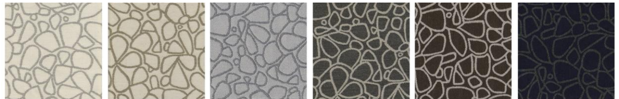
SAMMAL 110 / 101